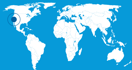
Location California, USA

Life safety and fire protection systems may seem like a straightforward network of sprinklers, alarms and detection sensors—unless that system must fit within a space with high peaks, twists, turns and seemingly disconnected lines such as a life-size castle at a theme park.