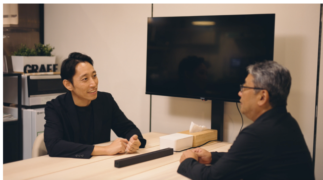
In-person after-sales support provided by Qproducts, ZW3D's distributor in Japan