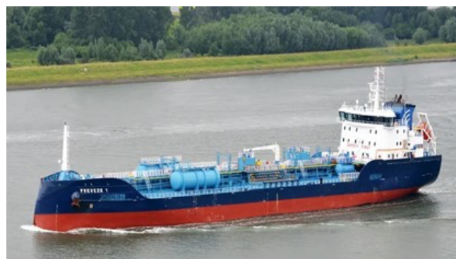
Tanker ships designed by Norden Ship Design House

ZWSOFT persistently introduces product updates to enhance software performance and refine existing