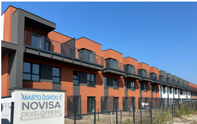
Garden City 3 (Miasto Ogród 3), two Novisa residential buildings with 70 flats, including private gardens and terraces

Headquartered in Warsaw, Poland, Novisa Development has become a significant player in the real estate industry by creating modern, high-quality residential developments. The company specializes in developing comfortable, functional, and eco-friendly flats and houses, all designed to foster community and offer residents access to nature. Novisa's commitment to sustainability and innovation is at the core of its approach, focusing on creating harmonious living spaces that meet contemporary needs.