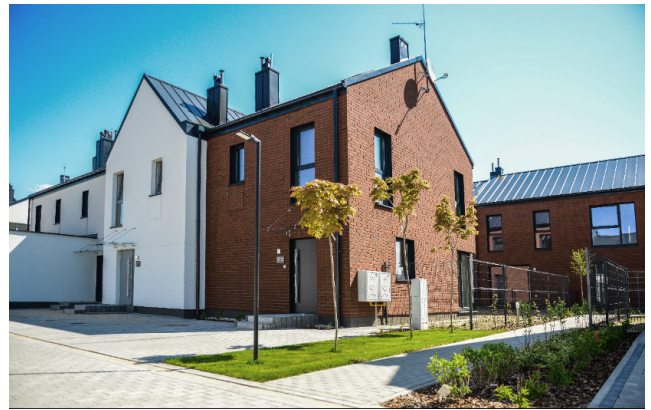
Novisa Modern, an exclusive residential project in Nowa Wola, featuring 59 semi-detached homes with modern architecture, cozy charm, and thoughtfully designed spaces