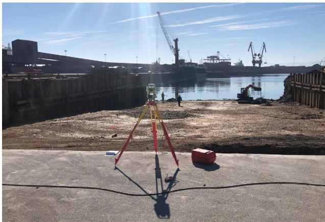
SEITOP Conducting Field Surveying Operations

Founded in 2010, SEITOP INGENIEROS S.A.L. has grown into a well-established expert team in the engineering and topography sector in Asturias, Spain. With a wealth of experience dating back to 1992, the company's professionals bring decades of expertise to every project they undertake.