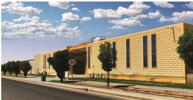
Sadr headquarters in Riyadh, Saudi Arabia

Established in 1994 in Saudi Arabia, Sadr has evolved into a leader in manufacturing, logistics services, and modern storage solutions. The company specializes in manufacturing shelves, storage systems, wooden pallets, and iron products. Additionally, Sadr offers comprehensive logistical services, including warehouse leasing, management, and operations for third parties. Over the years, Sadr has served a diverse range of clients within Saudi Arabia and beyond.