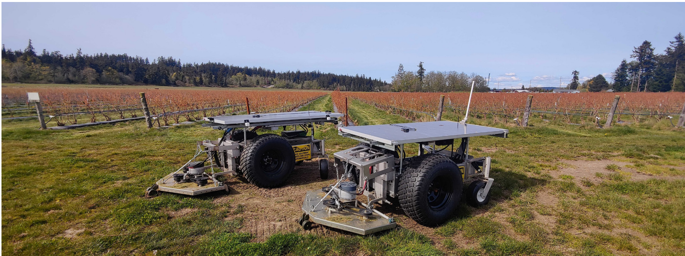
LCRs working cooperatively in a blueberry farm

D455 as our primary navigation sensors, and GPS devices as our secondary sensors. We can achieve centimeter precision using machine vision, a massive improvement over GPS in challenging environments and vitally important when operating equipment around critical infrastructure.”