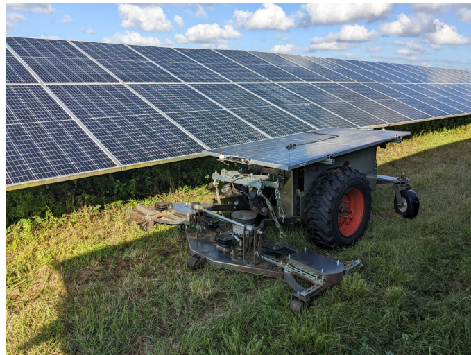
LCR with 8' mower deck managing the vegetation on a solar farm

The LCR samples the depth image at 15 frames per second. The data is channeled through several layers of heavy filtering to remove artifacts and transform it into data representations that can be efficiently manipulated by the CPU: semantic filtering, 2D filtering, and 1D filtering. Since RealSense technology processes the depth data within the camera, it takes much of the load off the robot’s CPU. This is one of the reasons that Directed Machines can use a low cost, highly efficient compute processor such as the Raspberry Pi to interpret the visual data.