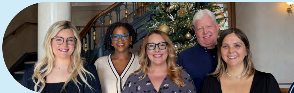
City of Chattanooga's Office of Grants and Opportunities Team