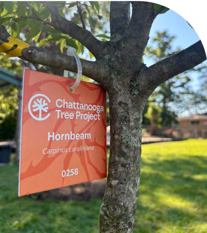
Chattanooga Tree Project tree and tree tag funded through $6 million forestry grant.

The implementation process also prompted the creation of a citywide grants manual. "Before, we had a few basic compliance policies. Now we have clear steps for every stage of the grant lifecycle," said Chelsea. "Much of that came from what we learned from the AmpliFund team as we implemented the system."