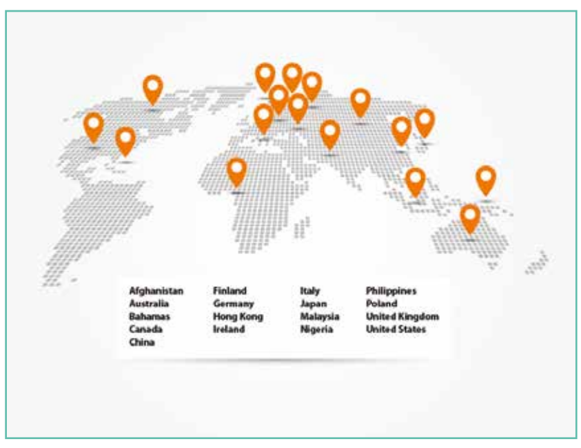
Figure 1: ICISF expanded their reach to Afghanistan, Australia, The Bahamas, Canada, China, Finland, Germany, Hong Kong, Ireland, Italy, Japan, Malaysia, Philippines, Poland, and the UK.

Prior to 2015, ICISF only offered in-person workshops in the United States. However, after moving online, they have been able to expand their reach to more than 17 countries. Some of the groups they have been able to train, include police, forest service, fire and rescue, park service, airline pilots, U.S. Marshals, and the military.