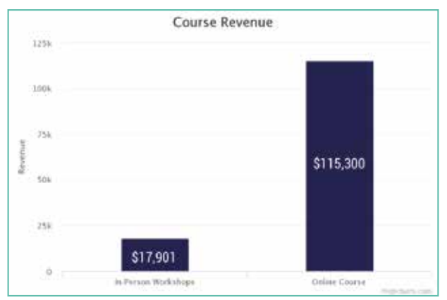
<sup>1</sup> 2017 enrollments includes projections through December 31, 2017. Revenue figures are through June 1, 2017.

ICISF used CourseArc to create their courses. CourseArc was so easy that even non-technical subject matter experts were able to create engaging, high-quality content without needing any development skills. Because CourseArc integrates into any LMS using Learning Tools Interoperability (LTI), ICISF has the flexibility to offer the content using multiple delivery methods.