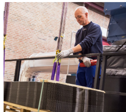
Replacing the old heat exchangers' plates with new ones at AffaldVarme Aarhus