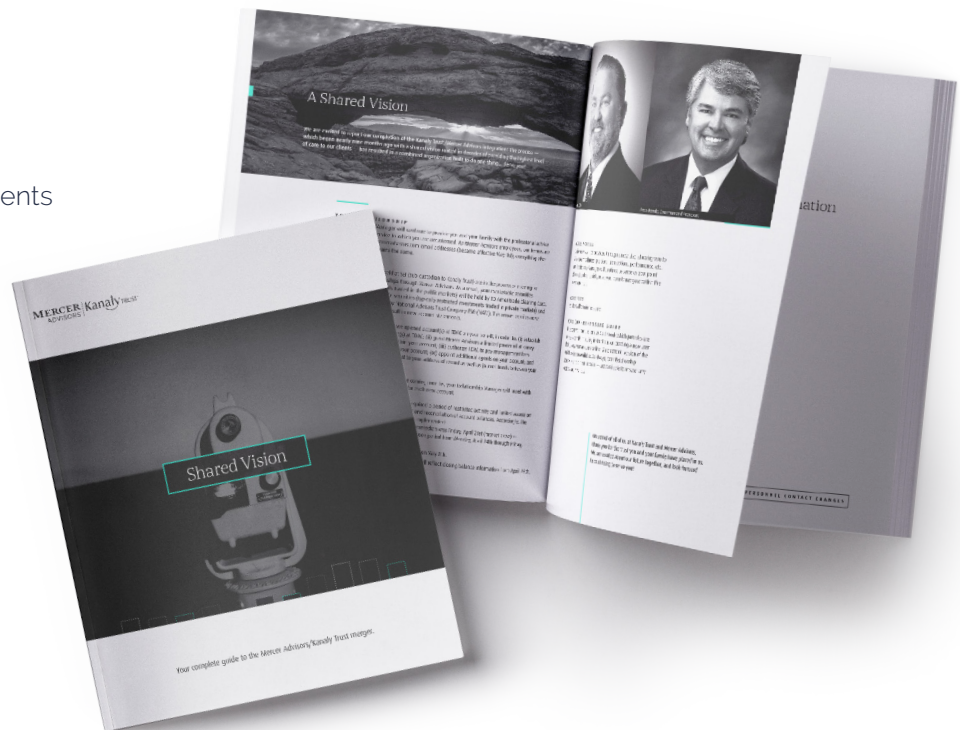
Shared Vision Flipbook