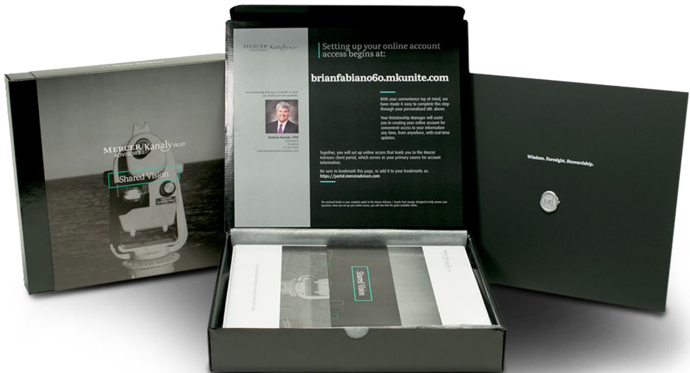
Merger Kit (Complete)