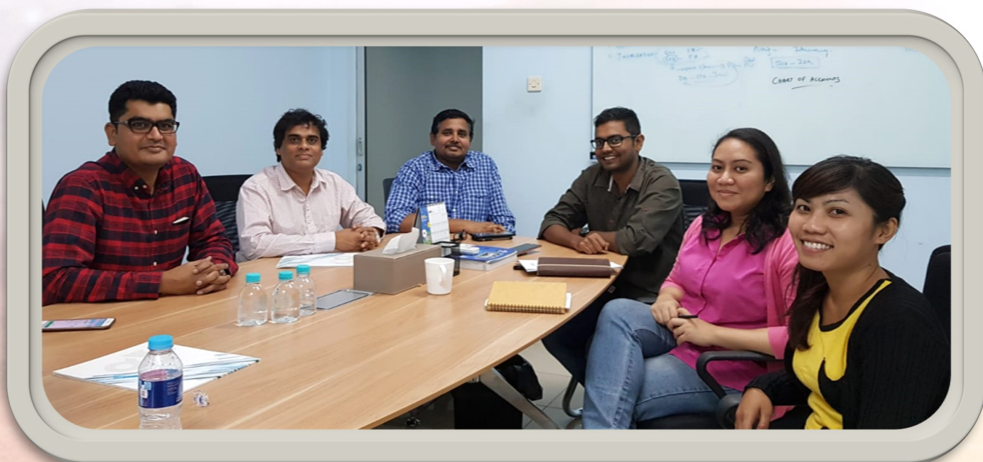
Focus Softnet Singapore team with the PT. Airlock Indonesia team during one of the sessions for scoping and deployment