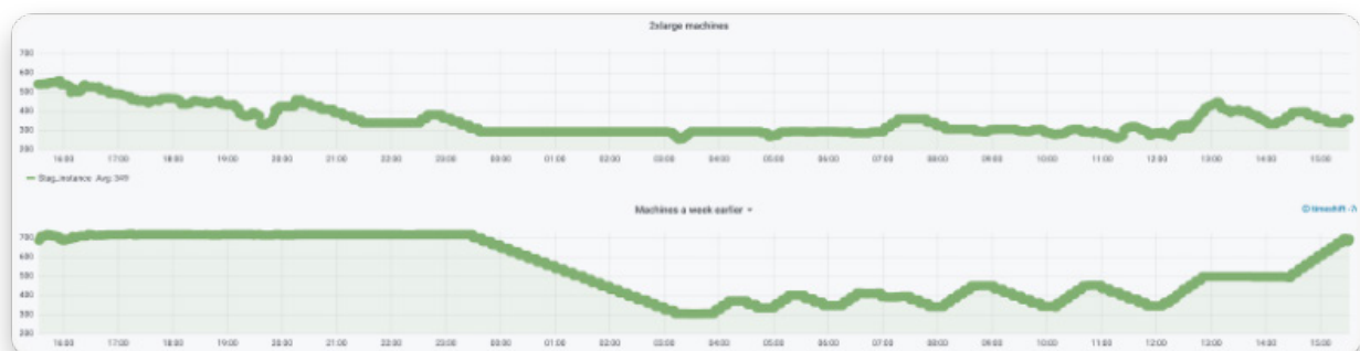
Figure 3: Number of machines with Granulate (upper) vs without Granulate (lower)