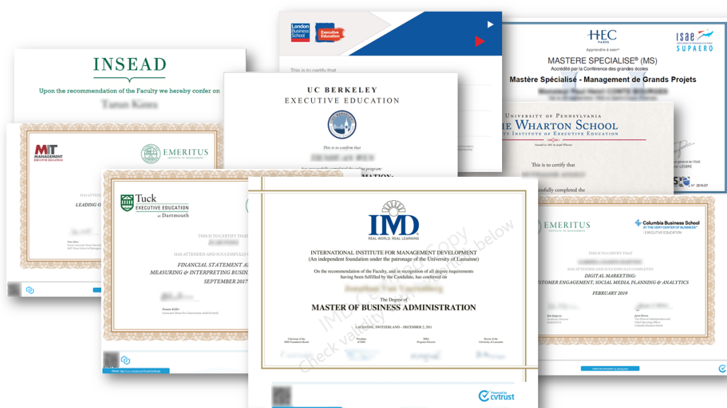
Any Smart Certificate can be quickly and easily verified

Smart Certificate 2.0 also guarantees the validity of documents issued using the platform. At any time, a qualification or other accreditation can be verified by clicking a link or scanning a QR code. This ensures that anyone who claims they have attained a qualification can be proven to have done so.