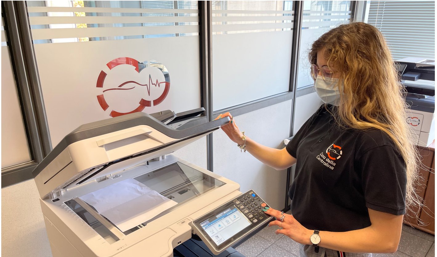
A member of the Casa della Centralina team using OKI's MC883 Multifunction Printer

The dynamic company is always ready to face new challenges. Over time, it has expanded its service to include lorries, vans, motorcycles, boats and tractors, and has shown exponential growth. In 2020 it saw its customer base increase from 6,000 to over 7,000 and employs more than 20 staff across different departments including administration, management, sales, technical workshops, warehouses and digital solutions. This rapid development made it necessary for the business to relocate several times and meant the enormous flow of goods could no longer be managed with just two printers or copiers shared between the various departments. Each department must remain autonomous with well-run workflows to avoid delays and disruptions. For example, once each control unit has been inspected,