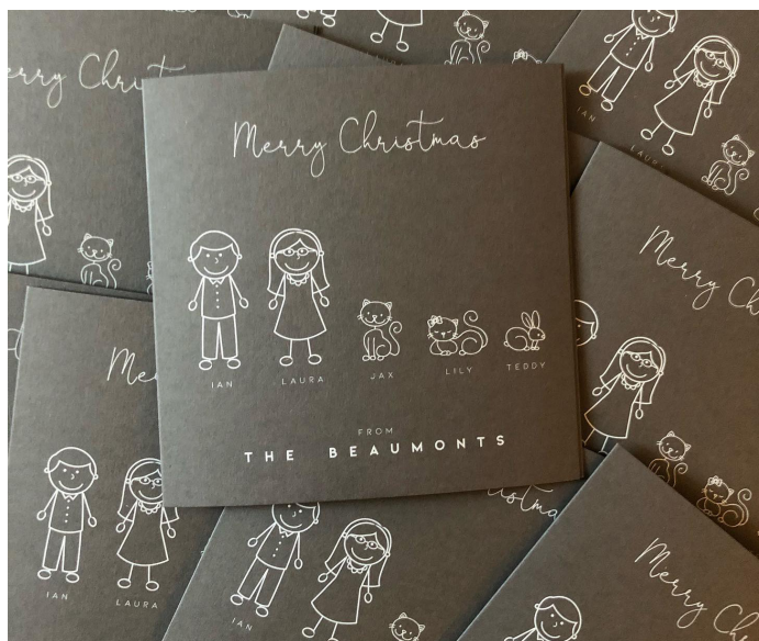
Example Elle Bee Design greeting cards printed in white on dark card using OKI’s Pro9542.

The timing of Betty’s arrival turned out to be perfect too. “We brought Betty (OKI’s Pro9542) in at the start of the first