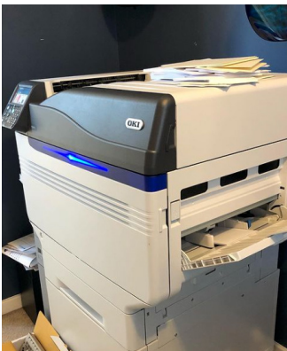
Bertha (OKI C911)