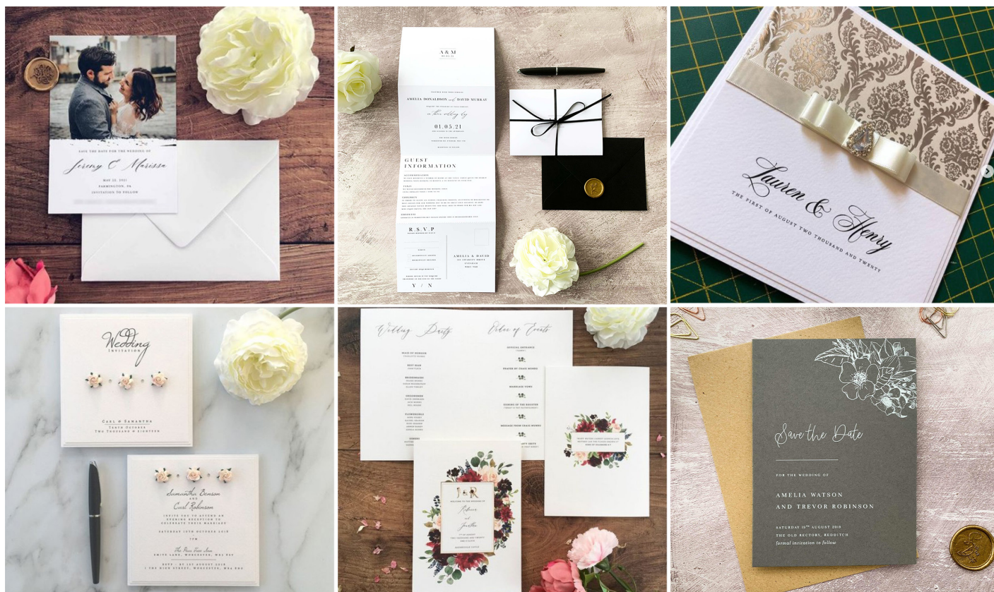
Sample Elle Bee Designs Printed on OKI's printers.

As Beaumont explains: “We needed to start looking at something that can be created and approved digitally and quickly printed.” After a short spell outsourcing printing, the team brought in the versatile C911 A3 colour printer from OKI, now affectionately known as Bertha. “OKI’s A3 colour printer has really blown the doors off for us and opened up a whole new world of opportunity that we never knew existed,” said Beaumont.