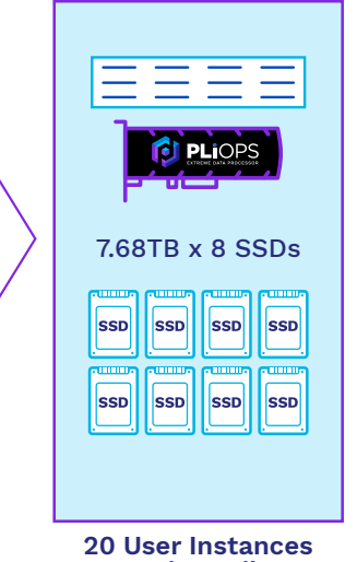
66TB, XDP Drive Fail Protection 0 Server Failures/Year