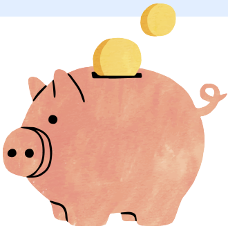
Drug spending per-member per-month

After a seamless pharmacy benefits implementation, Rightway has helped the property manager realize immense savings.