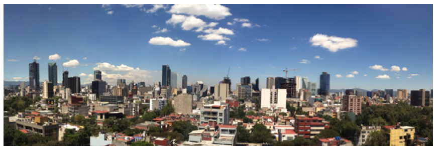
Hascom is headquartered in Mexico City, Mexico.